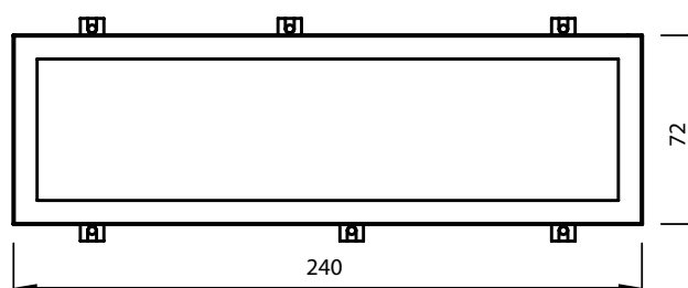
Dimensional drawing B